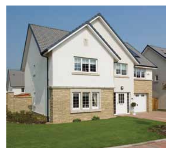
for technological innovation and exceptional design